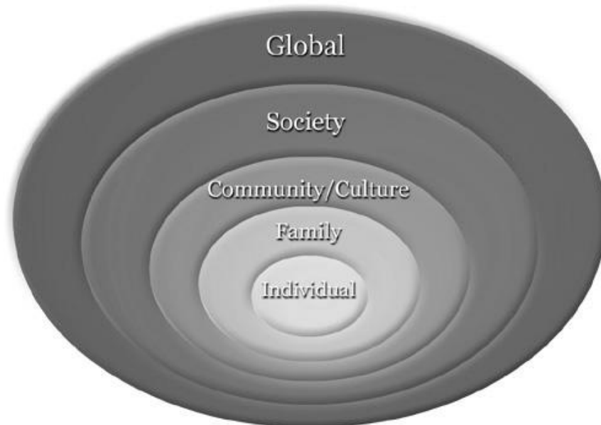
Figure 3. A holarchy of personal development

The complete framework then consists of the ten domains and three core elements as well as the developmental ecology within which the individual lives and develops. This perspective is similar to the list of developmental assets proposed by the Search Institute (Scales & Leffert, 1999). In the Search Institute approach, adolescents need to have an environment that is conducive to development (labeled external assets), and acquire a set of knowledge, attitudes, and skills required for successful passage through adolescence into adulthood (labeled internal assets). The twenty external assets are specific factors of social capital provided by the family, school, neighborhood, and community (including religious organizations and adult role models) and must be taken advantage of by the adolescent. These are arranged in four categories: